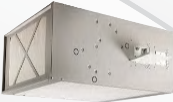
LSH model, for ducting