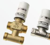
2- or 3-way valves