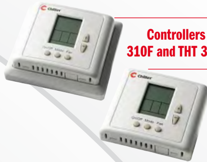
Controllers THT 310F and THT 320F