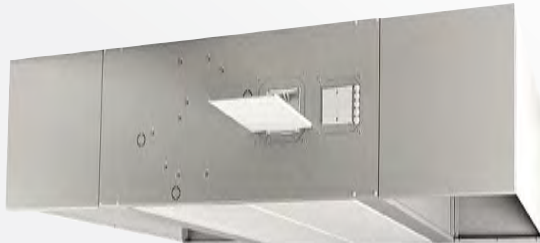
LSH model, with chambers