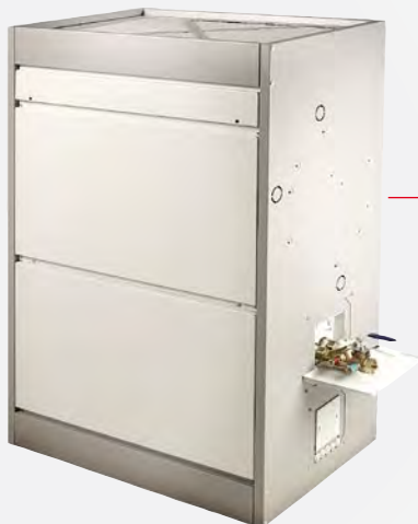
LSD model, blowing downward